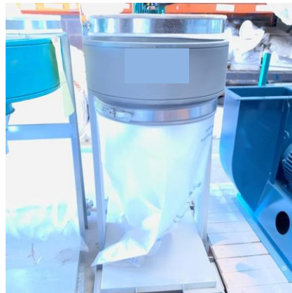
Example of portable extraction unit